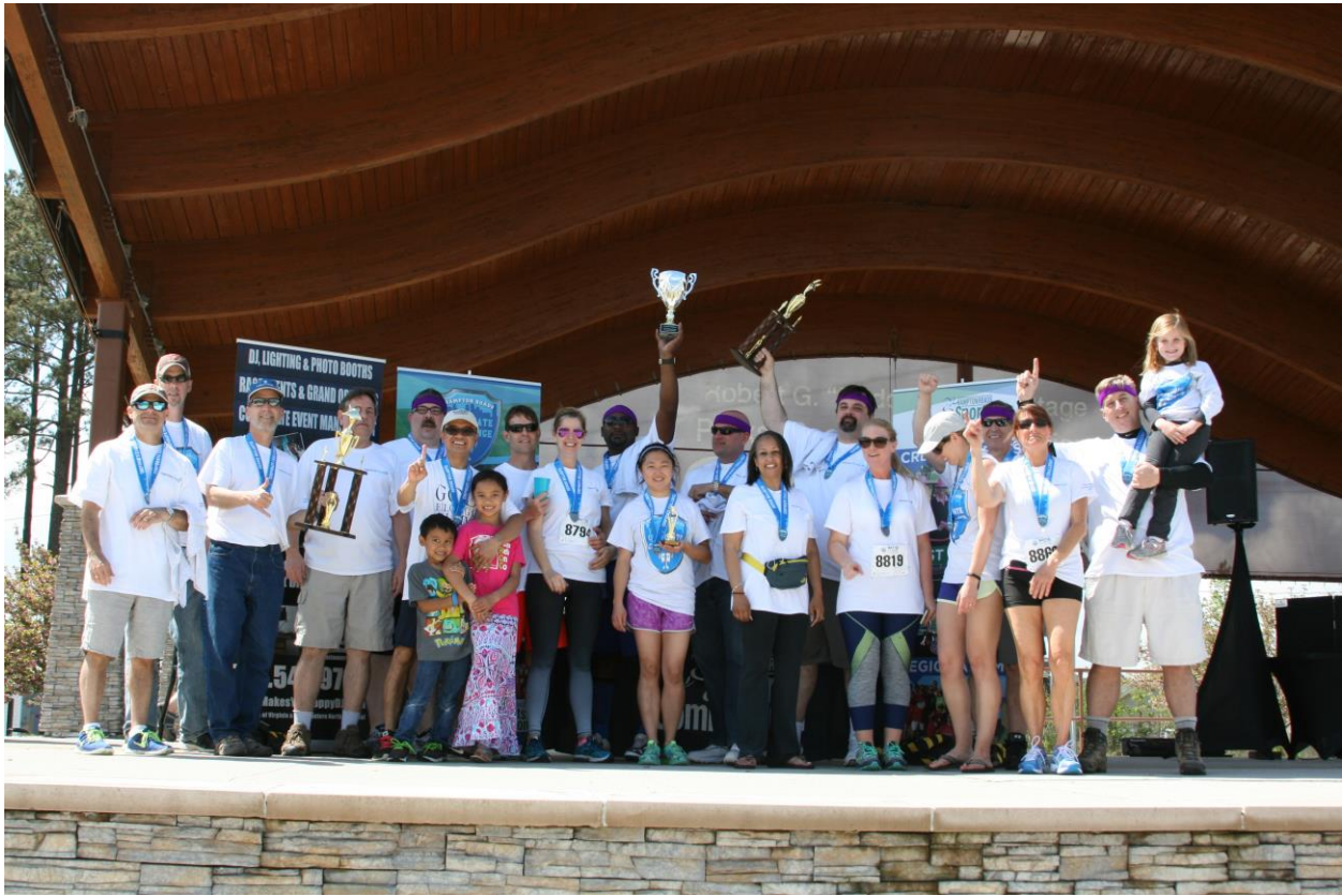
2016 Hampton Roads Corporate Challenge first place team, Optima Health.

From April 12-22, Optima Health will join more than 60 other Hampton Roads businesses to compete in the second annual Corporate Challenge, presented by Optima Health and organized by the Hampton Roads Sports Commission. Optima Health employees are gearing up for another fun team building opportunity, as well as the chance to network with other companies, after taking first place in the event last year. The 2017 Hampton Roads Corporate Challenge will feature a variety of sporting events, such as golf, bowling, kickball and a 5k run, promoting health and wellness for participants.